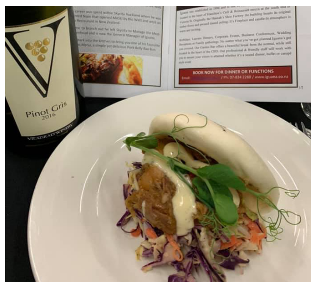
Pulled Pork Bao Bun served by Iguana Street Bar & Kitchen