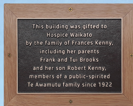
Above: The memorial wall plaque.