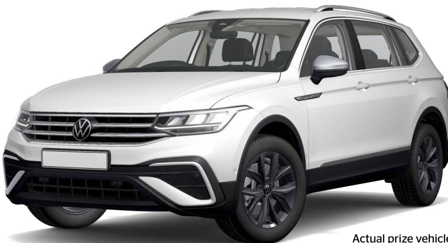
Actual prize vehicle may differ from image shown.

Five hundred tickets are available at $500 each. Tickets will go on sale later this month so please keep checking the Hospice Waikato website for your chance to purchase a ticket and be in to win - www.hospicewaikato.org.nz .